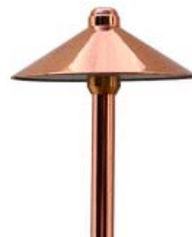
SHOWN IN NATURAL COPPER